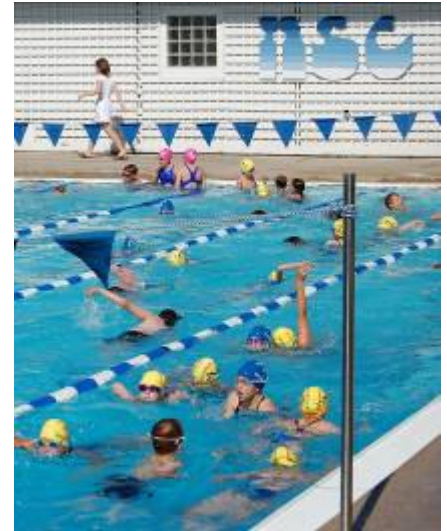
Everybody into the pool !

Any questions, ask a manager or a board member.