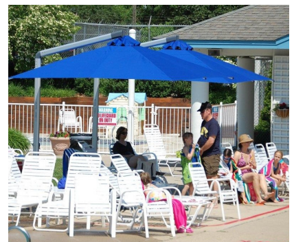
Enjoy and share the new shade !